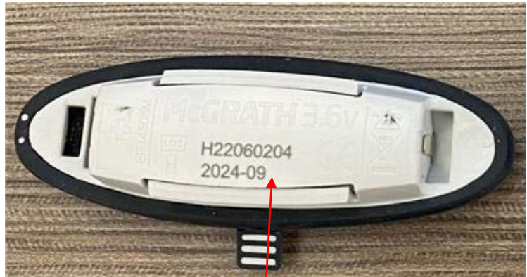
Back of McGRATH™ 3.6V battery - Use By Date