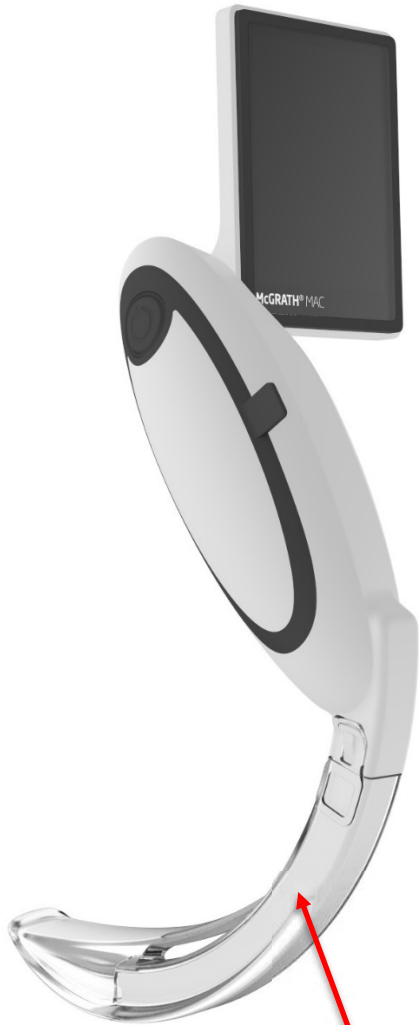
CameraStick™ (All one color)