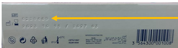
Figure 2A. Batch number is shown on this side of the box