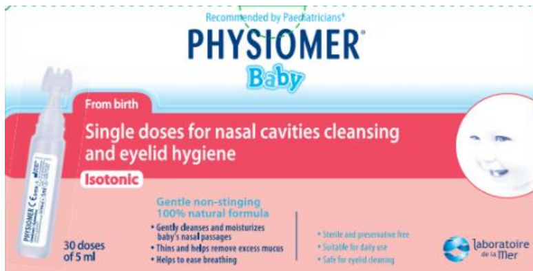
Figure 1. Outer package of Physiomer Baby Unidose

The recalled Physiomer Baby Unidose is identified by the batch number G239469 , expiry date: 03 / 2027. The batch number is printed on Physiomer Baby Unidose as indicated in Figure 2A and B.