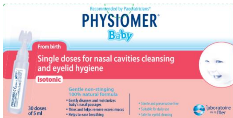
Figure 1. Outer package of Physiomer Baby Unidose

The recalled Physiomer Baby Unidose is identified by the batch number G239469 , expiry date: 03 / 2027. The batch number is printed on Physiomer Baby Unidose as indicated in Figure 2A and B.