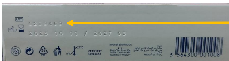
Figure 2A. Batch number is shown on this side of the box