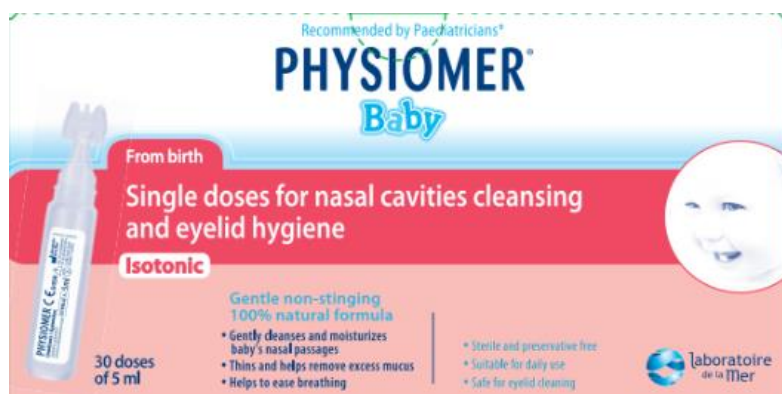
Figure 1. Il-pakkett ta' Physiomer Baby Unidose

Il-Physiomer Baby Unidose li qed jingabar lura huwa identifikat bil-batch number G239469 , expiry date: 03 / 2027. Il-batch number hu stampat fuq Physiomer Baby Unidose kif indikat fil-Figuri 2A u B.