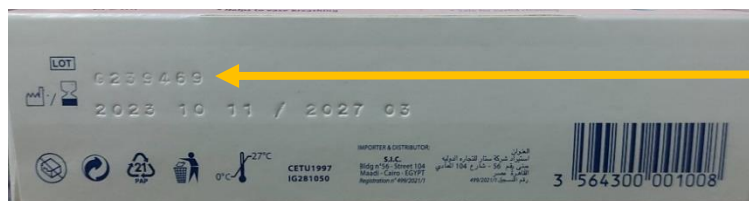
Figure 2A. Batch number fejn jidher fuq il-pakkett