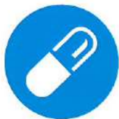
Start Pradaxa® 0–2 hours before next dose of injectable anticoagulant is due