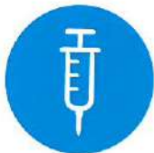
Previous injectable anticoagulant

The parenteral anticoagulant should be discontinued and Pradaxa® started 0–2 hours prior to the time that the next dose of the alternate therapy would be due, or at the time of discontinuation in case of continuous treatment (e.g. intravenous Unfractionated Heparin (UFH)).