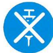
Do not give due dose of injectable anticoagulant