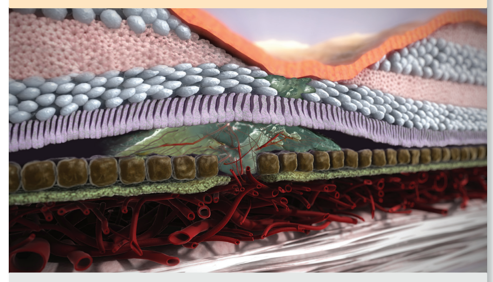
New, weak blood vessels grow and leak, damaging the macula