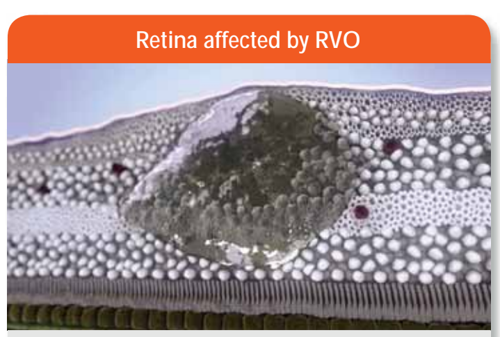
Blockage in a retinal vein increases blood vessel leakage, leading to accumulation of fluid