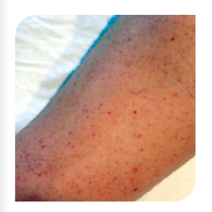
This is an example of a leg with petechiae.

Petechiae are small, scattered, "pin prick" spots under the skin that are red, pink or purple. Petechiae can occur anywhere on the patient's body, not just the legs.