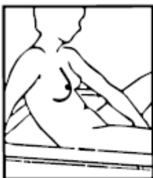
1. In the bath

Three recommended methods of using the product: Decide which method of insertion is easiest for you. It's important to be in a relaxed and uncramped position.