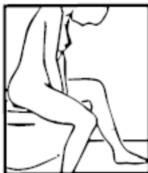
2. On the toilet or bed