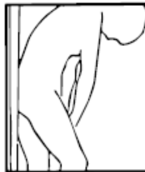
3. In the shower