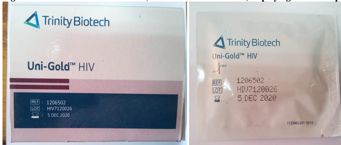
Figure 1 – Falsified Uni-Gold™ HIV, lot number HIV7120026, displaying falsified expiry date

Photographs and advice to the public are available below.