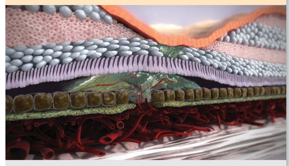
New, weak blood vessels grow and leak, damaging the macula