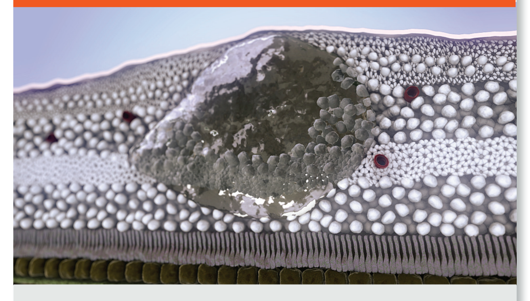
Blockage in a retinal vein increases blood vessel leakage, leading to accumulation of fluid